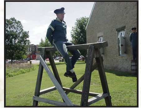
Tied on Sawbuck

Here are some typical punishments of the time. Which one of these punishments would you like the least? Tell why.