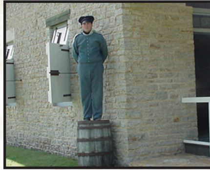
Standing on Barrel