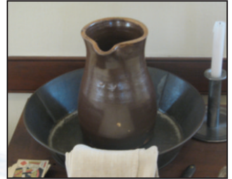
Pitcher and Wash Basin

Read the exhibit panels in the hospital and then answer the following.