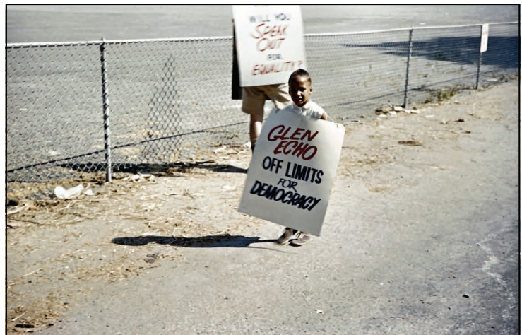
This young girl was not afraid to take a stand alongside adult picketers.

Imagine you were there protesting against segregation and were going to join the picket line at Glen Echo Park. Draw your own protest sign on the following page.