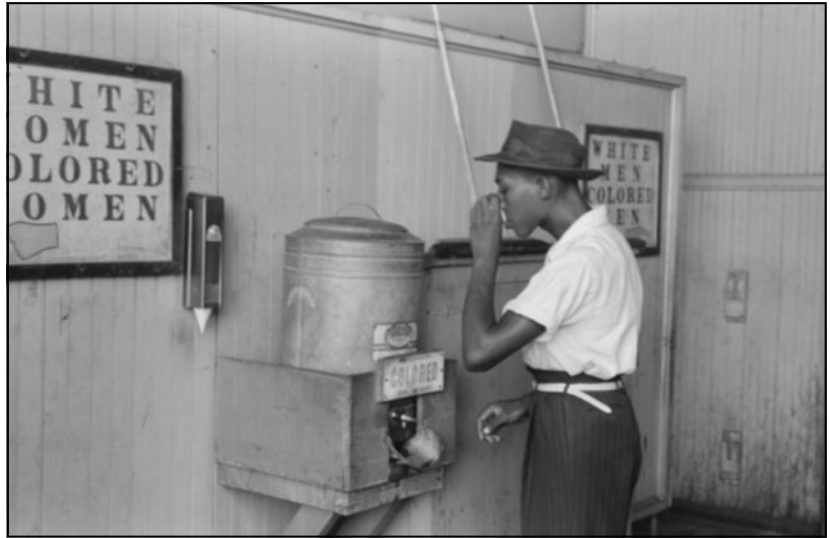
A young man takes a drink from a water cooler. July 1939.

For instance, in many places African Americans had to use separate restrooms than whites, separate drinking fountains, and sit at the back of the bus if they were allowed on at all. Businesses, such as restaurants, had to serve white and black people in separate rooms. Some chose to serve only white or only black people.