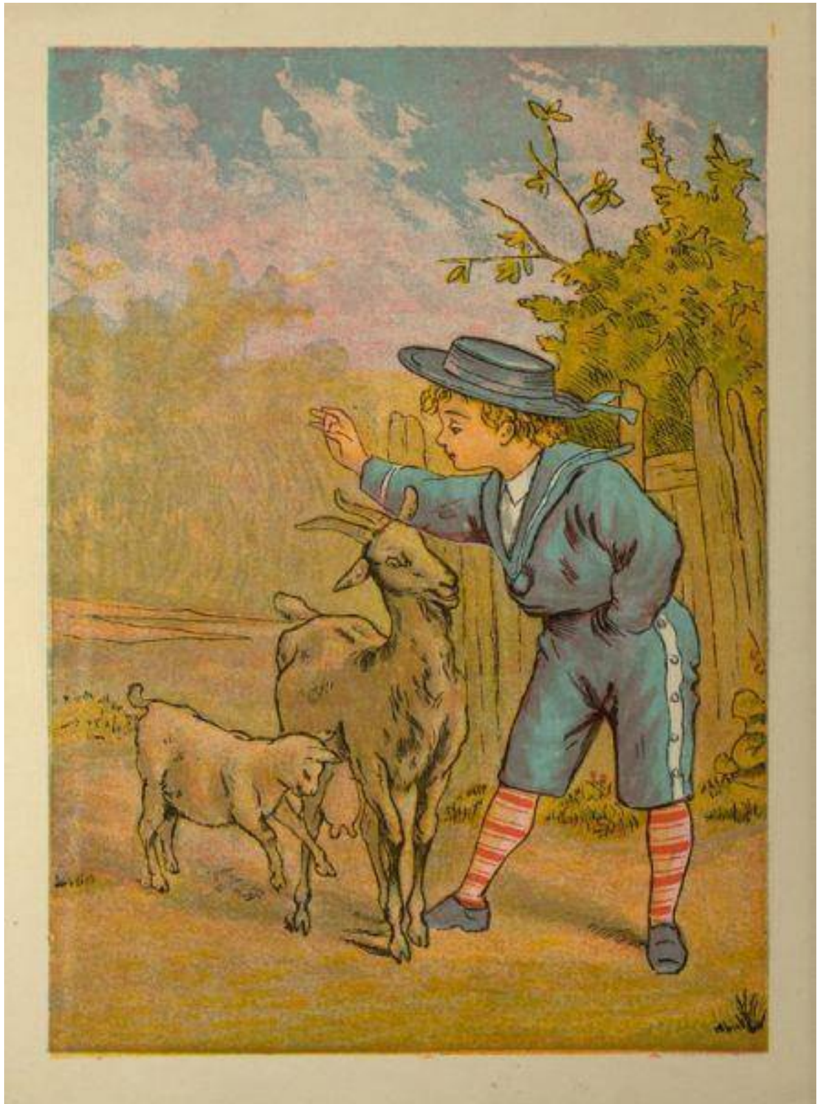
THE DOG OF THE REGIMENT