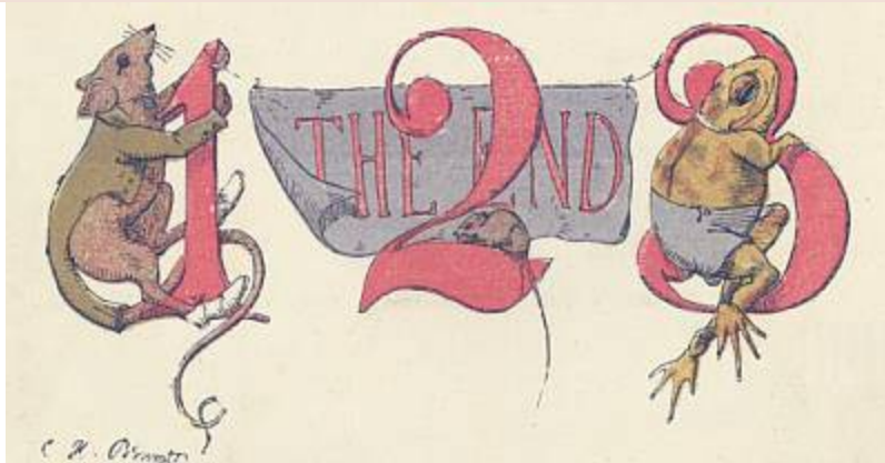
The Rat, the Mouse, and little Froggy.