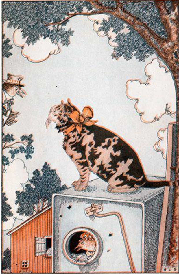
Illustration: Miss Kitty Cat Looked Calmly at Rusty Wren.

"I've come to make another call on your wife," she explained.