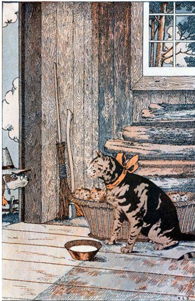
Illustration: Miss Kitty Cat Guards Her Kittens.

"There!" said Mrs. Green. "Now they're snug and warm. And I'll set your milk right beside the basket, so you won't have to leave your family when you drink it."