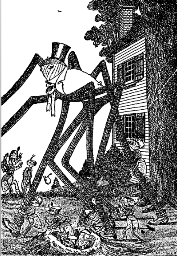
The Ant Soldiers Rushed at Daddy